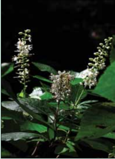
Clethra alnifolia (sweet pepperbush or summersweet) on the NFA's newly-acquired property at 196 Hattertown Road is just one of the many features that make it special..