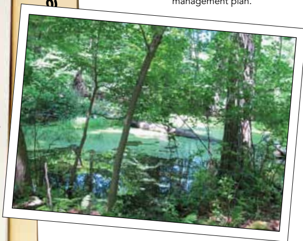
BOTOM LEFT: Looking downstream at 196 Hattertown Road.

BELOW: Ferns and other natural plants surround a pond on the NFA's newly acquired property. The NFA is currently having a professional plant and wildlife survey conducted of the property as a baseline for a comprehensive management plan.